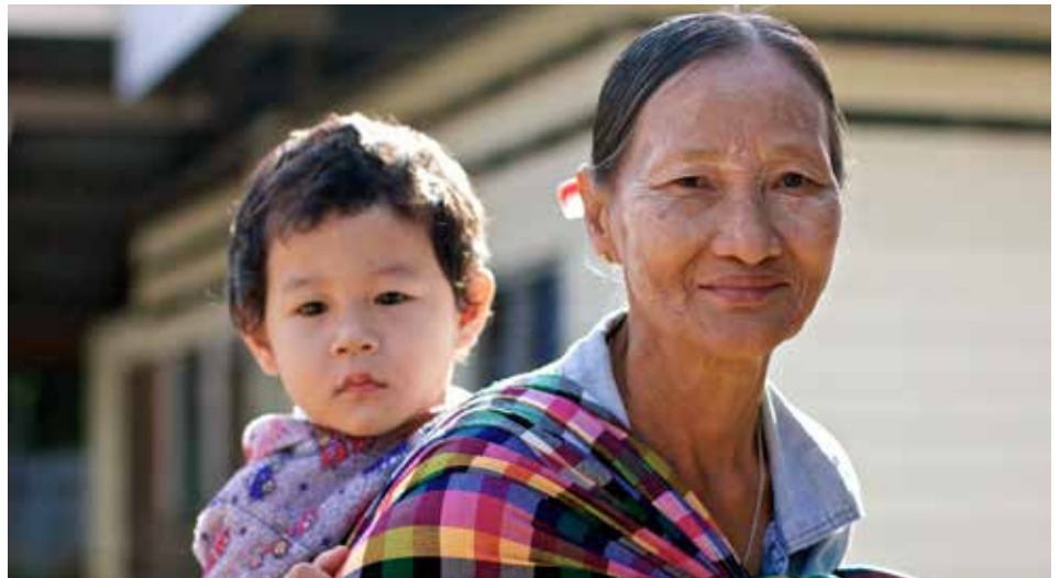
Image copyright Pearl Gan, Singapore 2017, from the Asia Malaria images exhibition.

Limited seats are available; kindly rsvp your attendance with Pearl Gan by 15th August 2017. Email: asiamalariaimages@gmail.com or contact Pearl at 9722 9982 (Singapore)